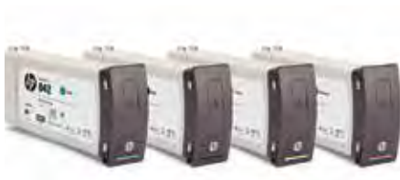
8 (2 x 775-ml per color with auto-switch)

The HP PageWide XL 8000 Printer includes a stationary 40-inch (101.6-cm) printbar that spans the whole printing width. As paper moves under the printbar, the entire page is printed in one pass, enabling very high printing speeds.