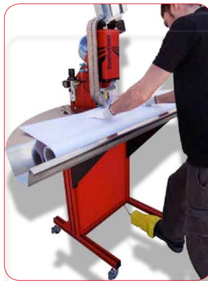
Optional stand with stainless steel plate