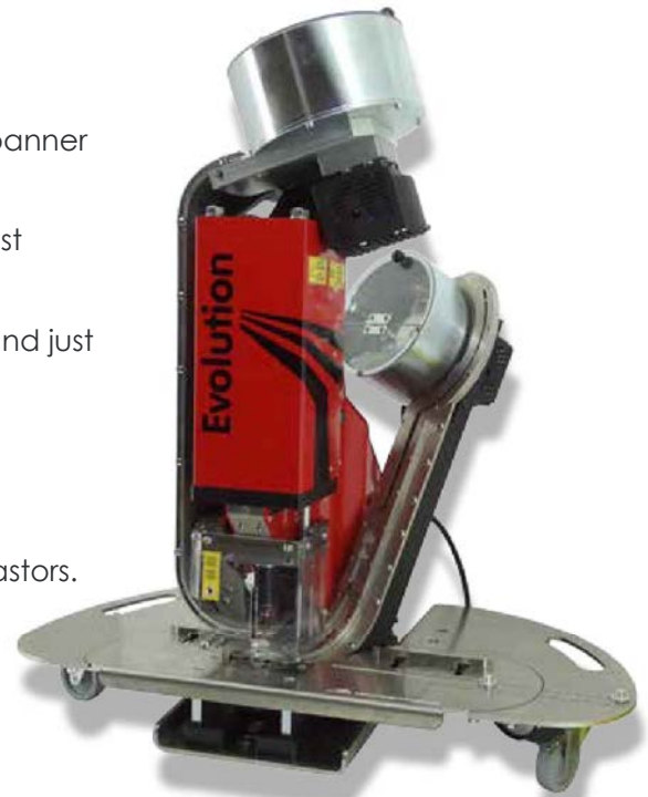
Eyelet positioning guide